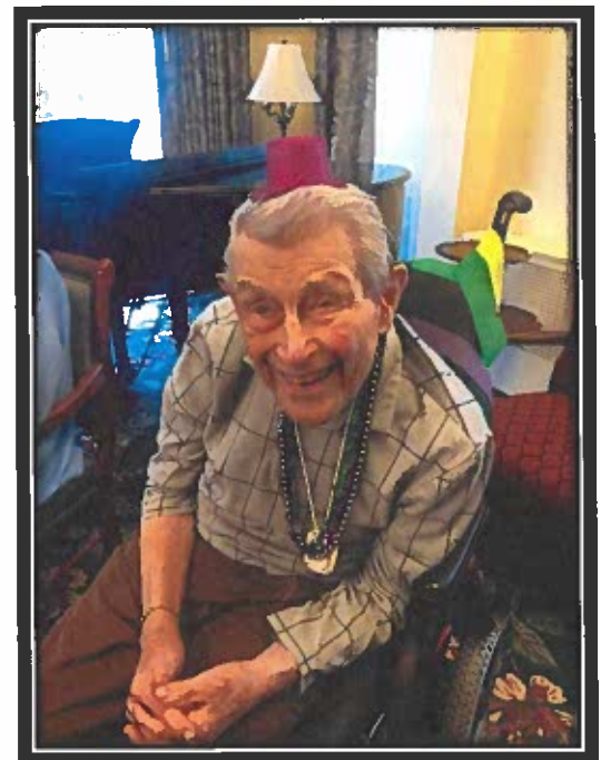
Enjoying the Mardi Gras festivities