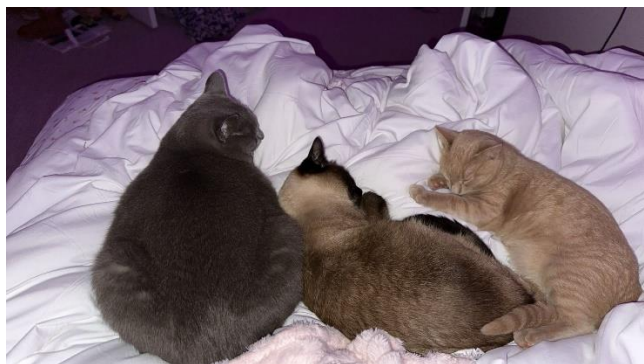
Gunny, Piper and Weasley