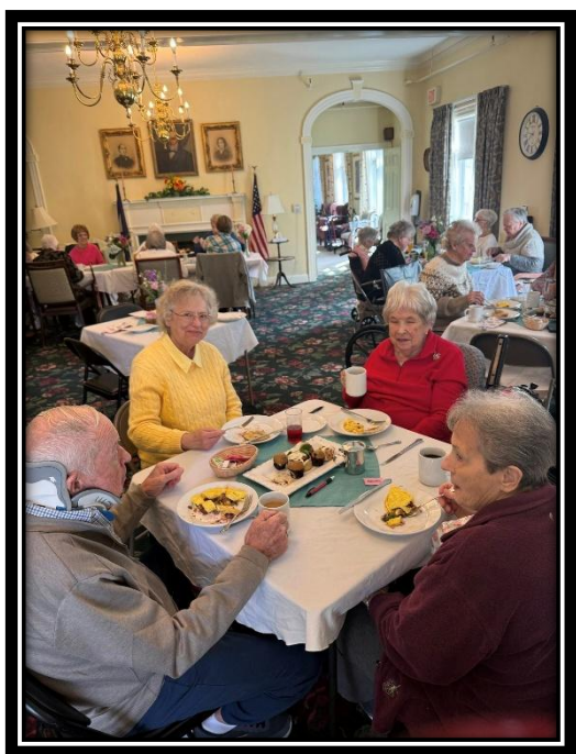
Beautiful Spring Brunch in honor of our AMAZING volunteers!

If you would like to be included on the schedule, please let nursing know.