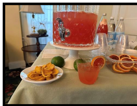
Mocktail Mondays are always a success